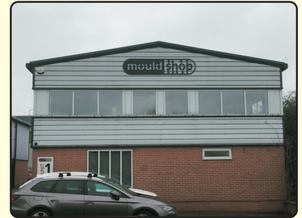
NB: the academy buildings exterior signage is branded as Mouldshop